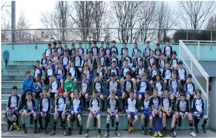
U 13 Coaches

Proud Sponsors of Cork Con Underage Rugby