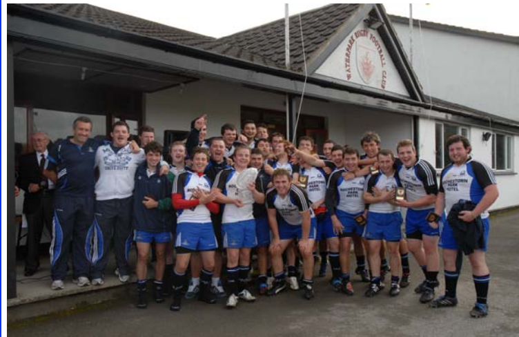
U 21'S Celebrate after winning Waterpark Tournament